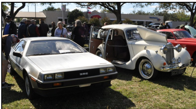
DeLorean and the Best of Show, 1939 Sunbeam Talbot 10