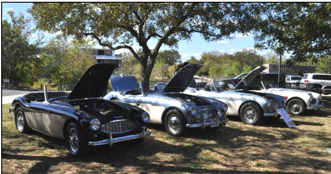
HEALEYS HANGIN' OUT IN BOERNE