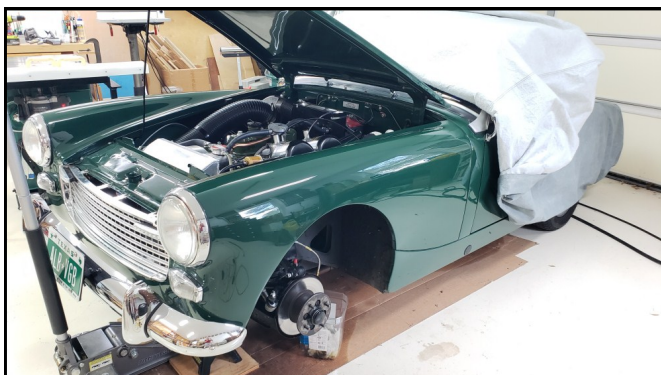
(In case you are wondering, the car is also supported by jack stands, not just the floor jack!)

Then I discovered the rubber boot on both tie rod ends had split open.