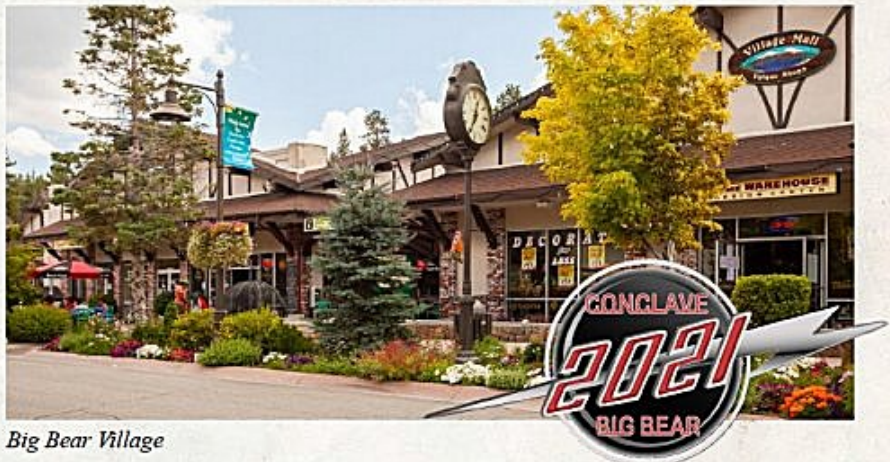
Big Bear Village

• MONDAY Night Cocktails and BBQ will be California Cowboy . The original California cowboy was a mix of traditional Old West cowboy and Spanish Vaquero. Any of your