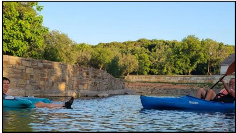
Pat & DJ enjoying a well deserved dip in the water

The good news is we got a great place on the water in Granbury which is large enough to host an overnight stay if we ever want to make a road trip. This is on a secluded cove & we have plenty of floaties & 5 kayaks so far.