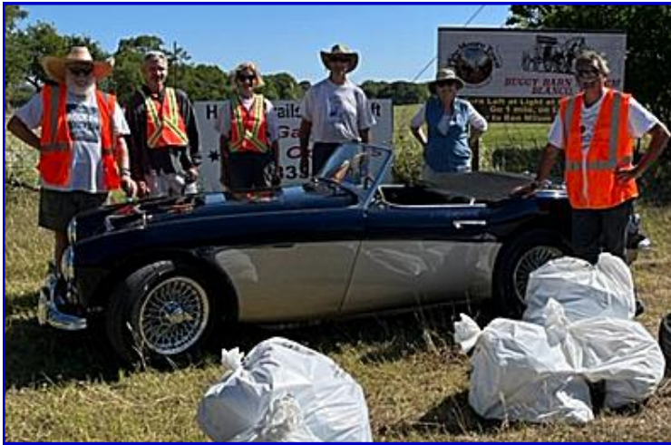
STAHC Highway Pickup, June 18

Vol. 2022, Issue 7, NEWSLETTER OF THE SO. TX. AUSTIN-HEALEY CLUB July, 2022 "INTERIM" STAHC WEBSITE & FACEBOOK