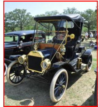
Wings & Wheels Fly-In, Old Kingsbury Aerodrome, May 7