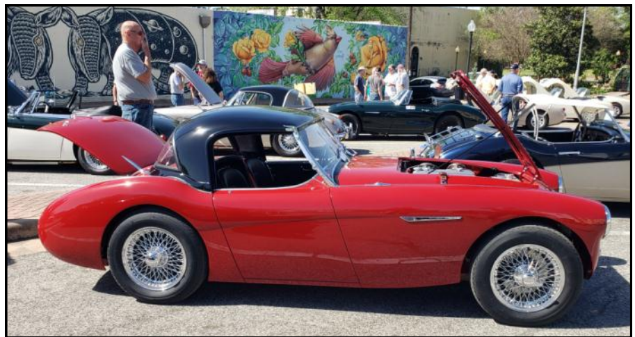
In addition to the beauty of our Healeys many buildings surrounding the Popularity parking area sported beautiful murals on their walls.