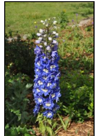
Seen on the grounds of the Antique Rose Emporium, Brenham, TX