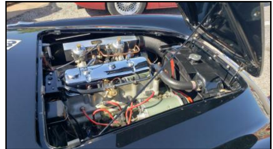
This Right-hand drive Healey 100 was absolutely spotless and defines perfection of a restoration.