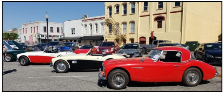
"Roadster Rows II and III"