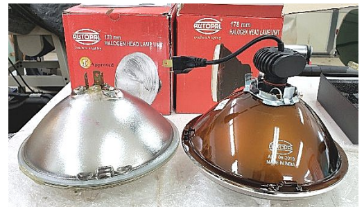
Halogen sealed beam headlight, left. Replacement LED semi-sealed beam unit, right.

While the car is undergoing these upgrades and repairs I decided to seek professional help. No, with my erratic generator charging. The generator, voltage regulator and battery were removed and taken to a generator/alternator/starter repair shop in San Antonio. As it turns out the generator has some internal parts that are burnt, and the 6 year old battery isn't holding a charge. Replacements have been ordered. When they arrive then the status of the regulator can be checked.