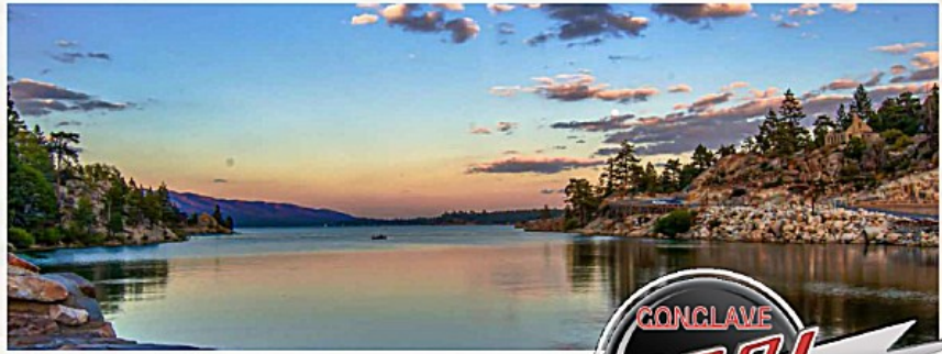
Join the fun May 16-21, 2021 at Big Bear Lake, CA!