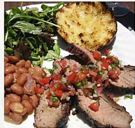
An authentic Santa Maria BBQ Dinner will be offered on Monday evening.

Don't miss out on this unique culinary experience!