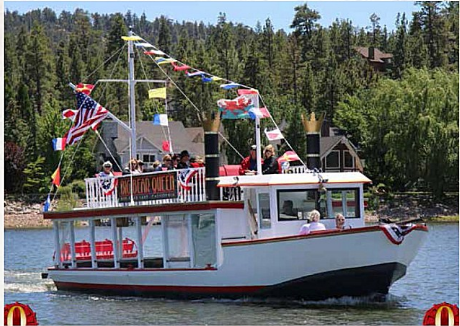
The Big Bear Queen, a paddlewheel boat, giving tours of Big Bear Lake on Tuesday and Wednesday evening.

On Monday evening, following a no host cocktail party, guests are invited to experience an authentic Santa Maria BBQ Dinner, the original California BBQ. Santa Maria-style*barbecue is a regional