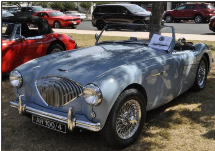
It has won 1 st place three time at the Boerne All British Car Days.