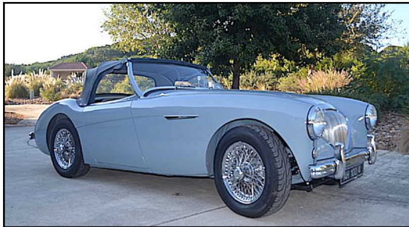
The day the restoration arrived