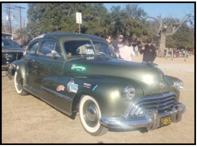
This is a beautifully restored 1948 Oldsmobile 88 with a '49 Rocket V8 engine. It has participated in 3 runnings of The Great Race and will also be in the next one.