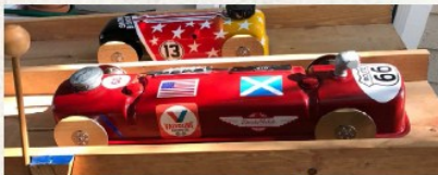
Rocker Cover Racers at the Ready

Check-in , time for a Car Wash (on site) or to relax in the Social Center. No host evening Cocktail Party with appetizers and a special Guest Speaker . Silent Auction, Arts and Crafts