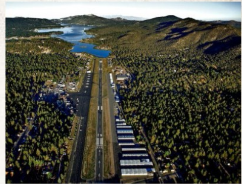
Beautiful Big Bear Airport

The Gymkhana requires advance reservation (but no charge), while the Funkhana is strictly "drop in and enjoy". Spectators are welcome at both events and there is an excellent restaurant at the airport.