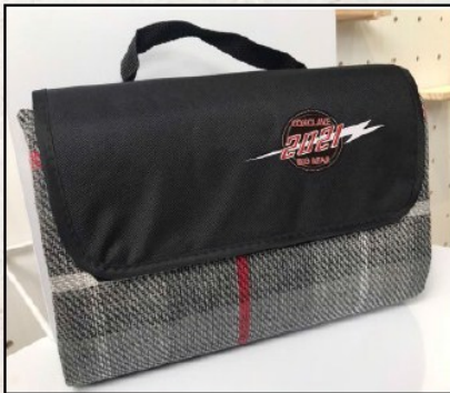
Folding picnic blanket doubles as a knee warmer in your car