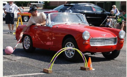
Top Down Fun at Conclave Funkhana