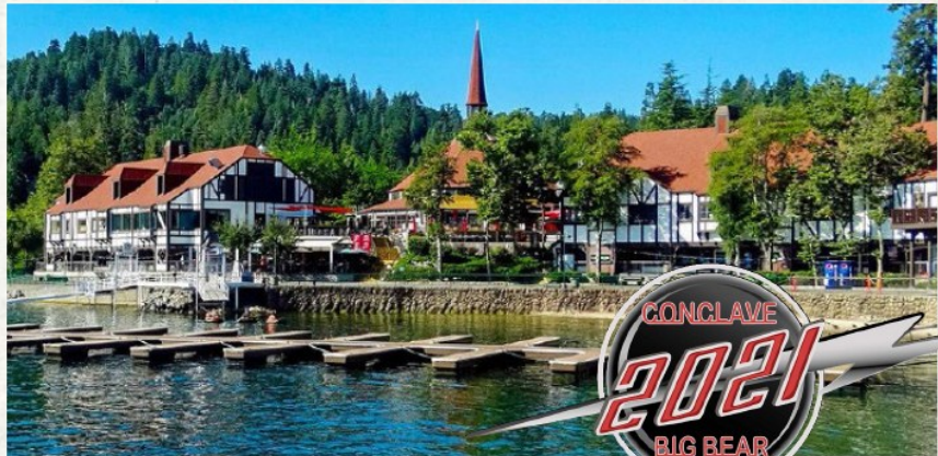
Lake Arrowhead Village