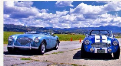
Don't Be Blue, Come to Conclave

to your parking spot on Pine Knot Avenue, the main drag in Big Bear where we will wow the tourists with our dazzling cars. Late afternoon will see the