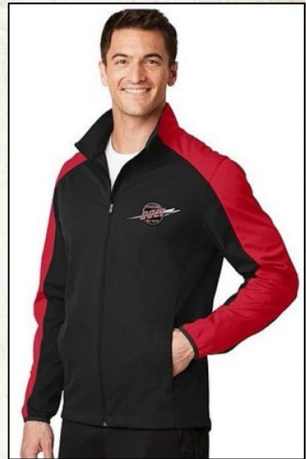
Two different men's jackets are offered

In addition to clothing, other Conclave themed items are on sale, including grille badges, adhesive backed commemorative tokens, event pins, picnic blankets and even extra copies of the cute Conclave mascot teddy bear (one will be provided free to each registered party).