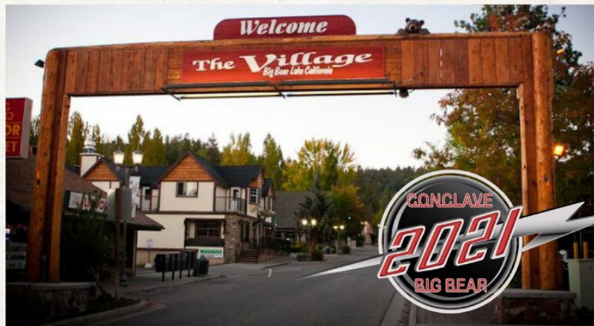
Photo: The Village - a beautiful shopping and entertainment district at Big Bear Lake, CA

Attendees are expected to enjoy the cool mountain air and expansive views across the lake and mountains during several drives including a Poker Run and Scenic Drive and Rally to Joshua Tree National Park. A Gymkhana and Funkhana will be held at Big Bear Airport and the Car Show on the village's Main Street will be a highlight for attendees and locals alike.