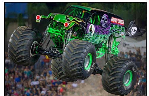
Monster Jam Truck Grave Digger